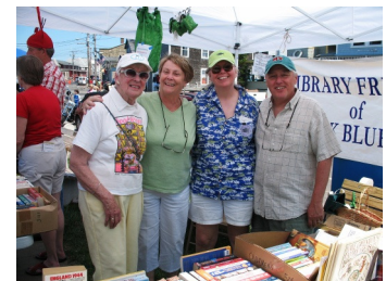
Library Friends, Book Sale

Look for these icons on the library's website and public computers!