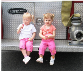
Two young firefighters in training!

Since June 1, children have started registering for the summer reading program, which begins July 1. This year the program is a hybrid of charity-based and prize incentive programs. Children will read through eight levels to complete the program, flying to eight planets, each one further from Earth. For each planet they land on, they will receive a “Polar Point” toward our charity and a raffle ticket for weekly drawings. Additionally, each planet level (one hour of reading or 4 picture books read or read to the child) carries a token prize, culminating with a Martha’s Vineyard Summer Reading 2009 T-Shirt. Prizes were donated by our generous merchants and the Library Friends of Oak Bluffs.