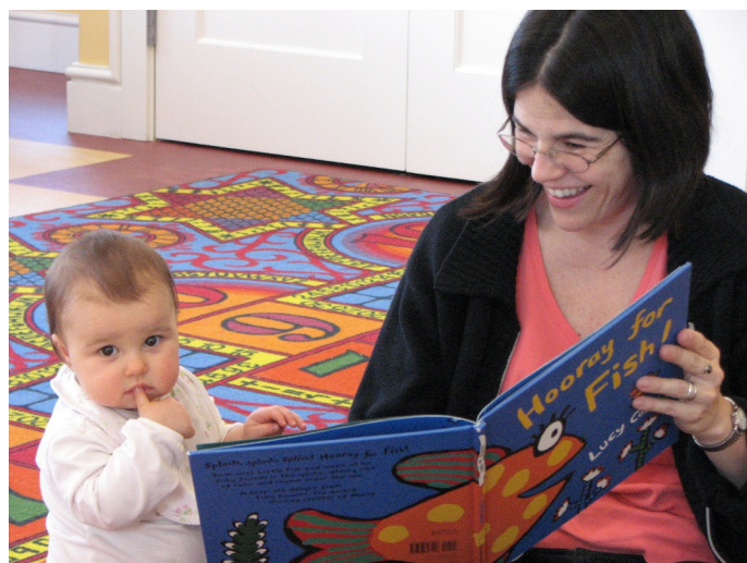
Mother and daughter enjoy a picture book in the children's programming room.