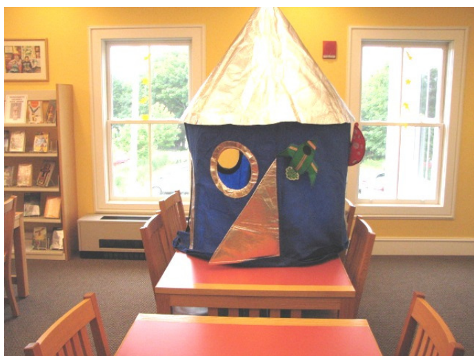
A volunteer engineer helped us build the spaceship located in the Children's Room.