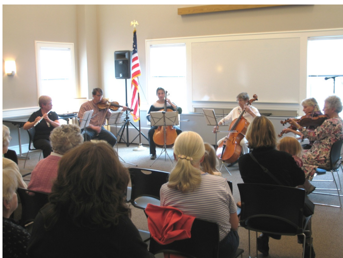
Vineyard Sinfonietta, playing a free concert at the library for a large audience.