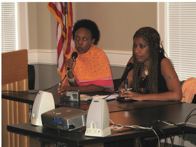
During July, Haiti's Minister of Women's Affairs and Rights spoke at the library.