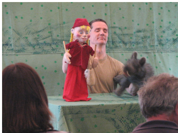
The Dream Tale Puppets show was a Summer Reading Program 2009 event.