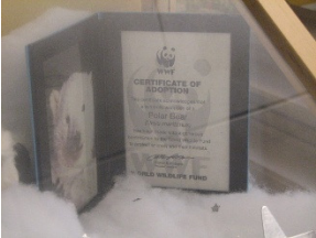
WWF stuffed polar bear and adoption certificate in Children’s Room.

Fall Programs: Our fall schedule includes weekly toddler and preschool storytimes on Wednesdays, three monthly books clubs: elementary, middle school, and teen on Saturdays.